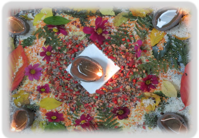
Diwali Festival of Lights