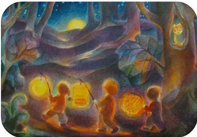
St. Martin Festival